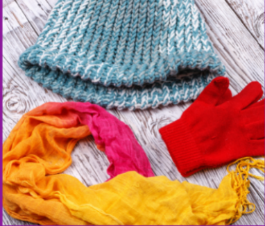
Hats, Gloves & Scarves