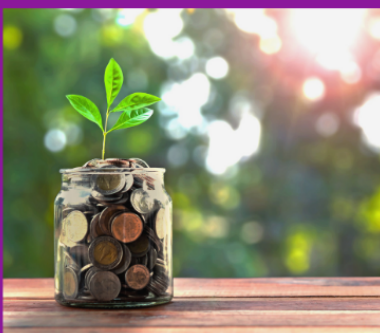
$9 Donation to Ship