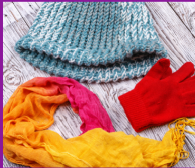
Hats, Gloves & Scarves