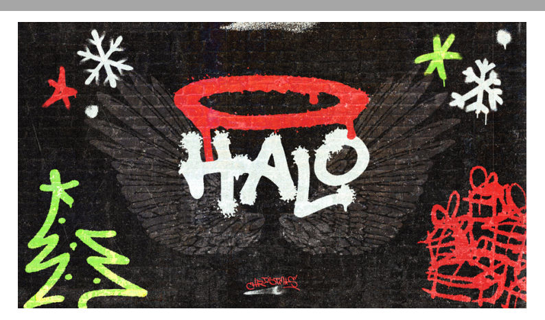
HALO: A STUDY FROM THE GOSPELS ON CHRISTMAS