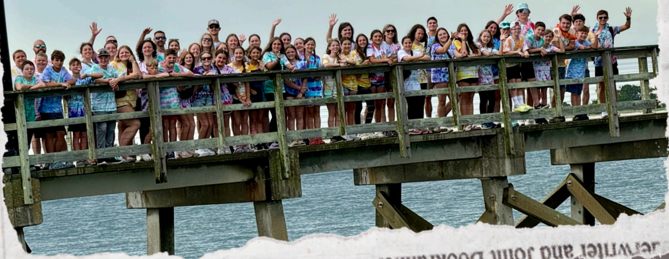
...er writer and joint bookrunner